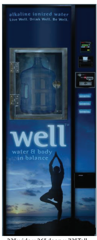
33" wide x 36" deep x 72" Tall

NAMA Certified (National Automated Merchandising Association).